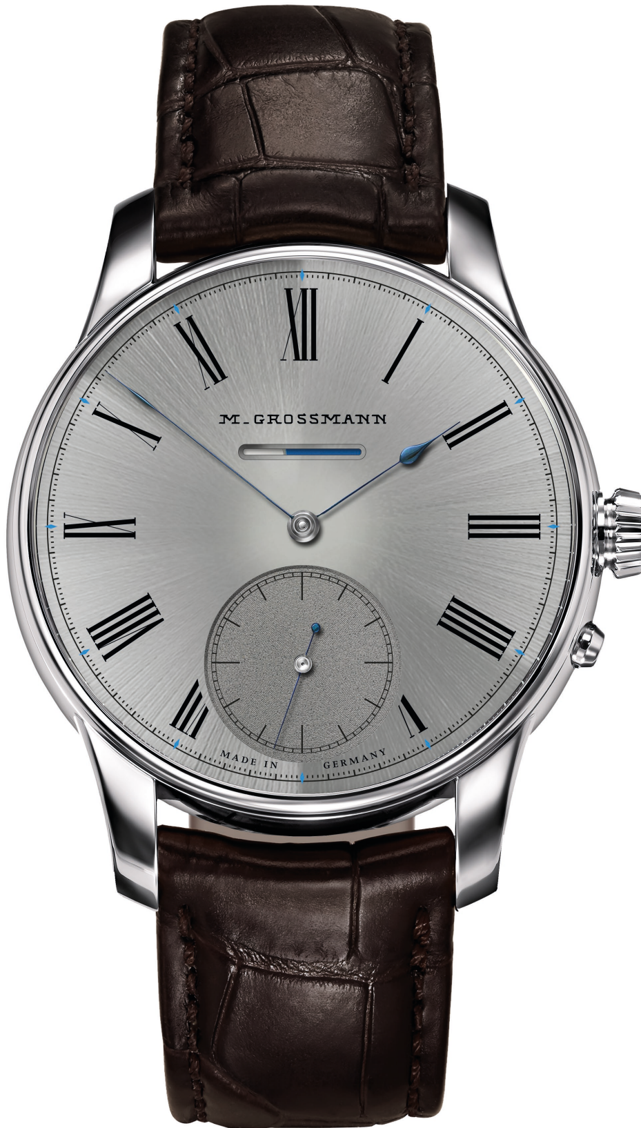
RESERVÉ DE MARCHÉ CLASSIQUE, white gold